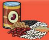
Cooked legumes 175 mL (¾ cup)