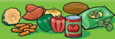
Fresh, frozen or canned vegetables 125 mL (½ cup)