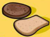
Bread 1 slice (35 g)