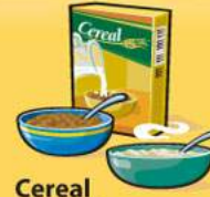
Cereal Cold: 30 g Hot: 175 mL (¾ cup)