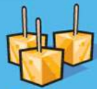
Cheese 50 g (1 ½ oz.)