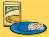
Cooked pasta or couscous 125 mL (½ cup)