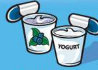
Yogurt 175 g (¾ cup)