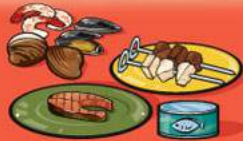
Cooked fish, shellfish, poultry, lean meat 75 g (2 ½ oz.)/125 mL (½ cup)