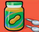
Peanut or nut butters 30 mL (2 Tbsp)