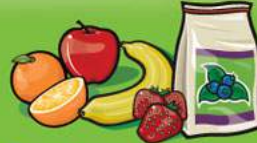
Fresh, frozen or canned fruits 1 fruit or 125 mL (½ cup)