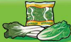
Leafy vegetables Cooked: 125 mL (½ cup) Raw: 250 mL (1 cup)