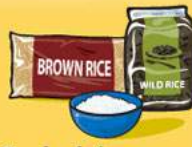
Cooked rice, bulgur or quinoa 125 mL (½ cup)