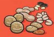
Shelled nuts and seeds 60 mL (¼ cup)