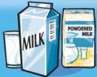
Milk or powdered milk (reconstituted) 250 mL (1 cup)